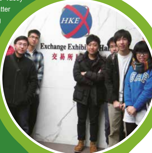
Students visiting Hong Kong Exchanges and Clearing Limited