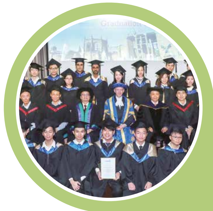
Graduation Ceremony 2019

Graduates may pursue postgraduate programmes offered by CityU, or other local and overseas universities. In particular, graduates of the programme have successfully enrolled in MSc in Computer Science offered by the Department of Computer Science, CityU and MSc in Electronic Ecommerce jointly offered by the Department of Computer Science and the Department of Information Systems, CityU. Relevant MSc or MBA programmes offered by Coventry University may also be available for further study in the UK, subject to application.