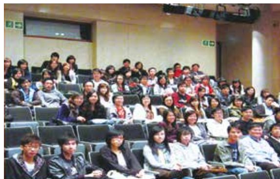
Students participating in class

2) Students may apply for government scholarship, grant and loans.